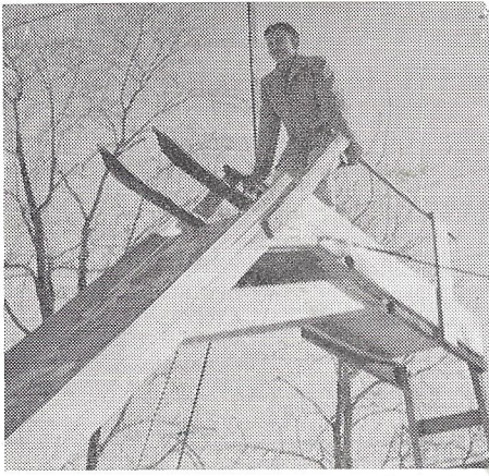
SLEDDING AND skiing are big sports in the area. Here, Garry Rupprecht, son of Clarence Rupprecht, pauses before hitting a ski ramp of the type now seen throughout the area.

There's no doubt of it. There's some good in everything -- even the near-record snows that clogged the highways, caved in roofs, and in general been an all-around nuisance for all of us most of this winter.