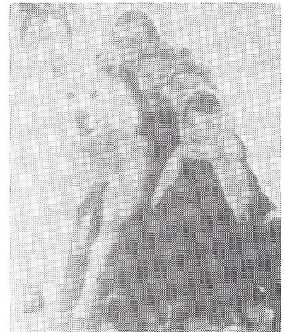
LIKE ANY dog, Nanuke is a great favorite with kids who find his furry coat irresistible.